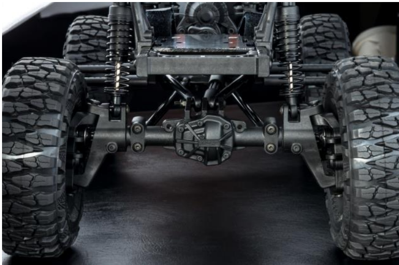
New MPA and portal-axle structures