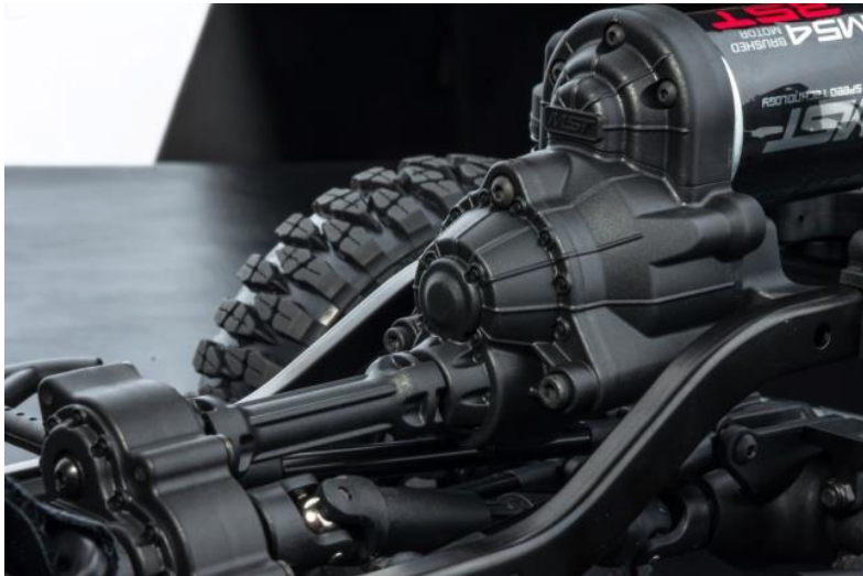
Front motor with the planetary gearbox