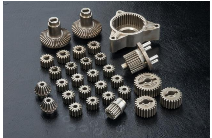
Full steel gears