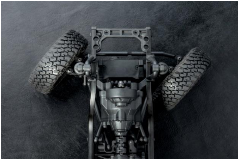
Great 40 degrees steering