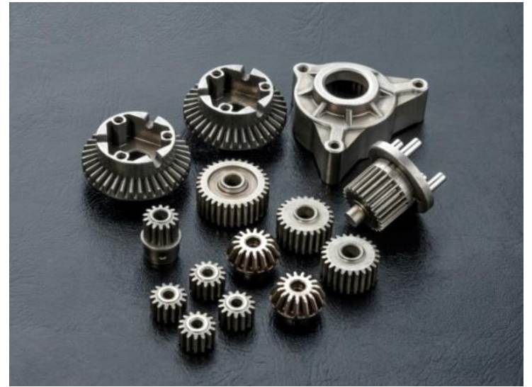
Full Steel gears